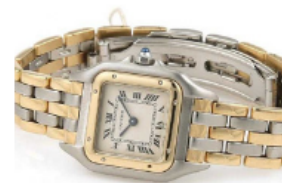
Cartier Tank Two Tone Panthere Watch

Estimate: $5000-7000 Achieved Value: $6250