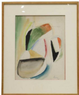
John Ferron Watercolor 1936

Estimate: $500-1000 Achieved Value: $1750