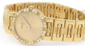
18Kt Yellow Gold Piaget Dancer Watch

Estimate: $500-1000 Achieved Value: $1750