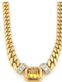
18K YG Greg Drake Citrine Diamond Necklace

Estimate: $4000-5000 Achieved Value: $5940